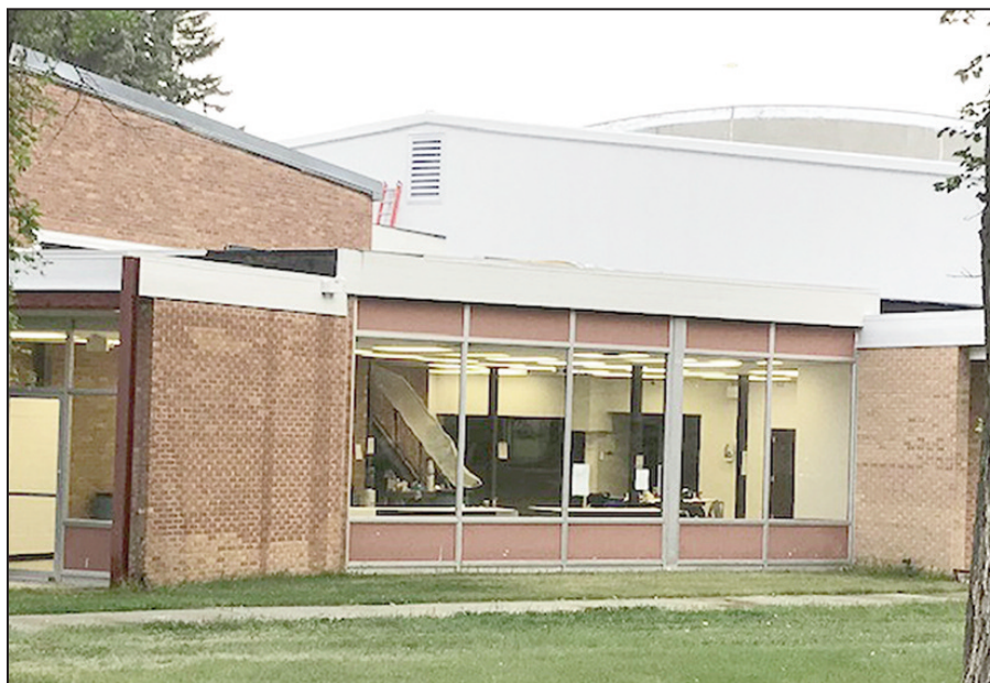
Renovations began June 22 to the St. Peter's College gym and arena roof. A new cover was put on the flat roof and a hip roof was added to the arena dressing room area.