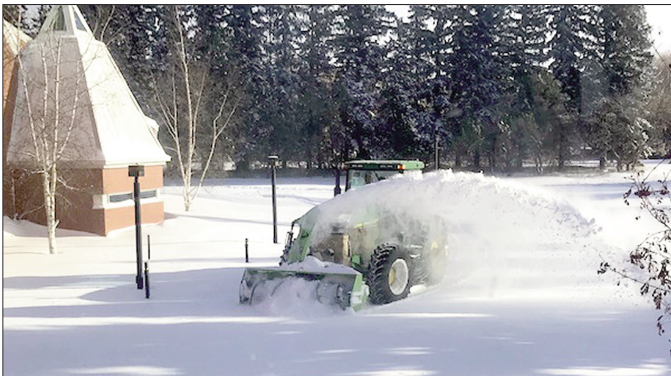
The weekend of Nov. 8 saw the first major snowstorm of this winter, with up to a foot of snow in some parts of Saskatchewan. Br. Basil luckily had the snowplow ready to clear away the snow.