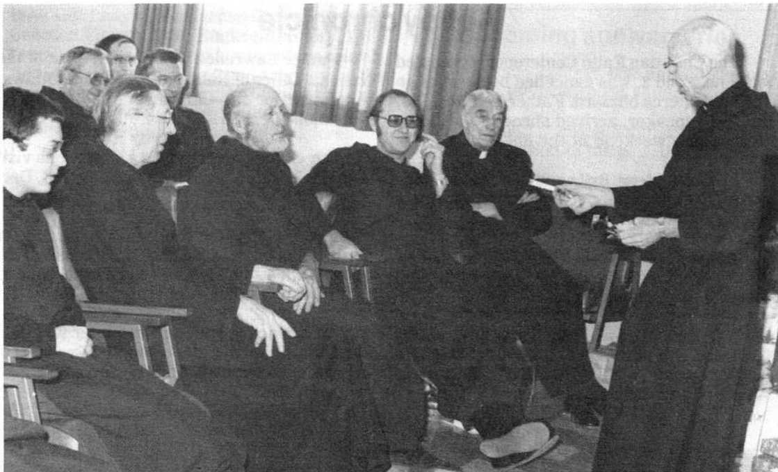
Opening gifts on Christmas Day.