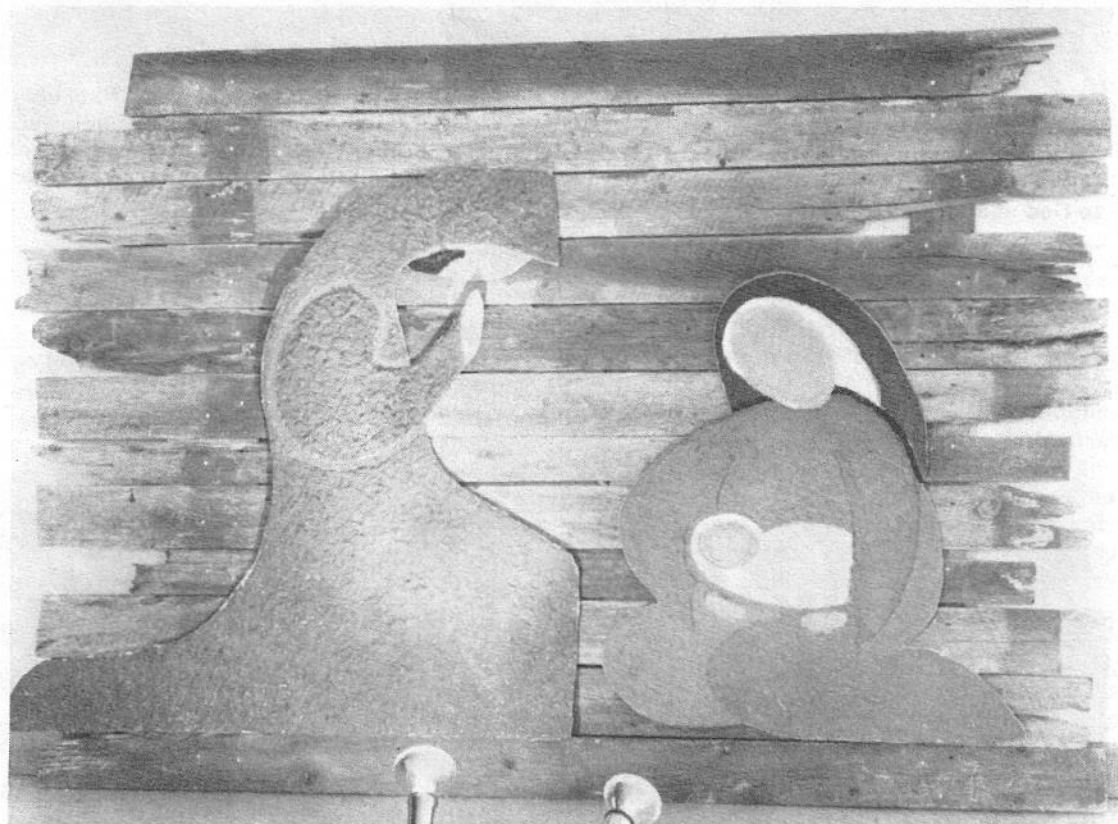
The chapel creche, made by the novices, featured paper mache figures mounted on a panel of weathered lumber.